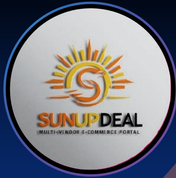
Sunupdeal Dhruv Thaman

The PPC campaigns run by Takahost Web Solution brought in immediate results. We noticed a 40% increase in traffic and a 30% boost in conversions within the first month. Their team is proactive, responsive, and always delivers.