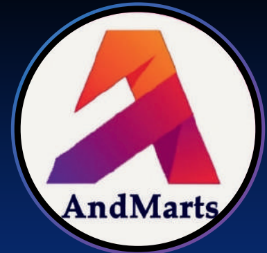
AndMarts Umar Lanka

Takahost's PPC service was a game-changer for our brand. Their strategic targeting and compelling ad creatives gave us the visibility we needed in a crowded market. In less than 90 days, we experienced a 25% increase in sales and a 50% rise in new customer acquisition.